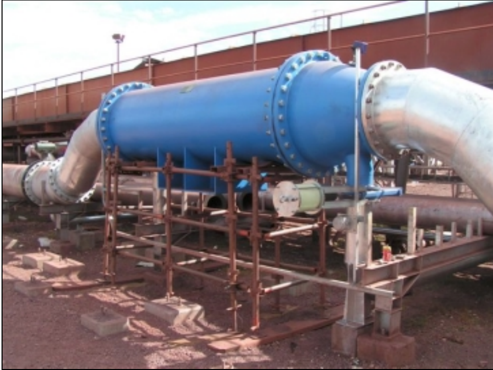
Screen Installation : Sishen Mine