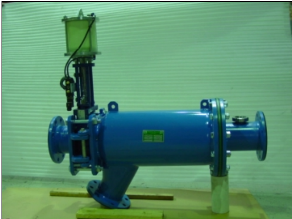
Screen Installation : Conduit Protector (De Beers)